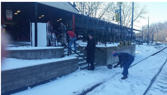
Clearing the Roberts platform and stairs.