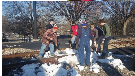
Snow removal crew at work clearing tracks.