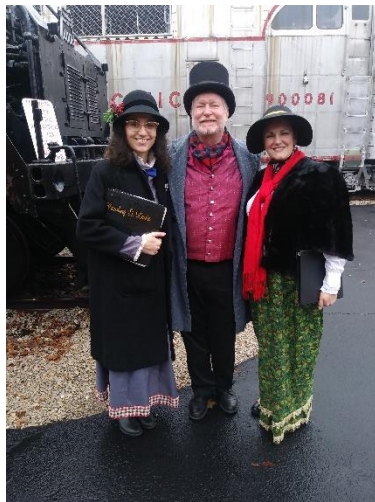
Carolers from Caroling St. Louis cheerfully provided excellent holiday entertainment for our many passengers on board.