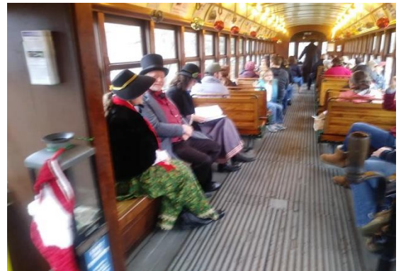
Below: One of the many car capacity runs.